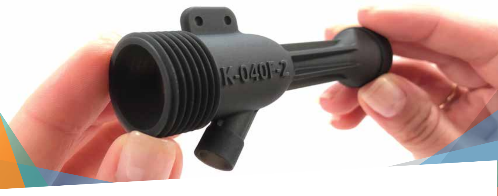
Figure 4<sup>™</sup> TOUGH-BLK 20